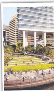
An artist's impression of the Eagle St project.

The most serious charge he faces under the 180-year-old Treason Act is "intent ... to injure the person of Her Majesty Queen Elizabeth II, or to alarm her Majesty".